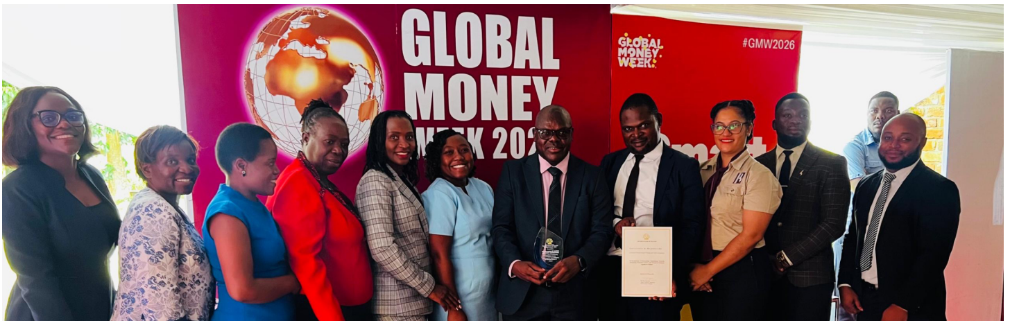
Various SACCO Members at the Global Money week event

As part of celebrating Global Money Week, Malawi Union of Savings and Credit Cooperatives (Muscco) together with various Savings and Credit Cooperatives (Sacco's) dedicated a whole week in March, conducting financial literacy sessions targeting various learning institutions in the country.