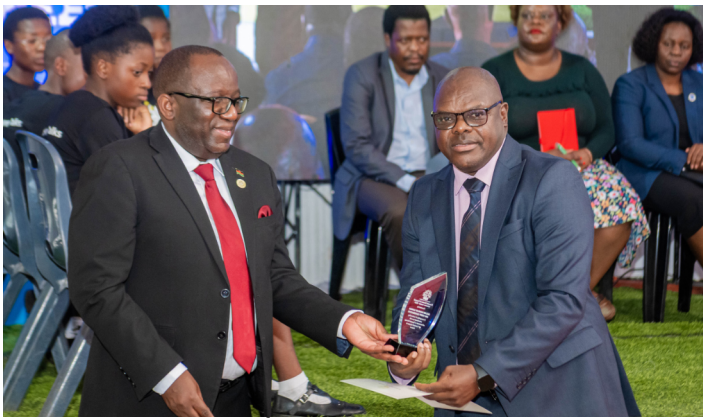
Muscco CEO receiving an award

As part of celebrating Global Money Week, Malawi Union of Savings and Credit Cooperatives (Muscco) together with various Savings and Credit Cooperatives (Sacco's) dedicated a whole week in March, conducting financial literacy sessions targeting various learning institutions in the country.