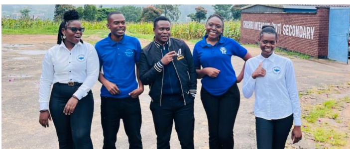
Sacco Staff Members at Chichiri Intensive School

After the launch educational sessions were done at Malawi University of Business and Applied Science (MUBAS), Nalikule Teacher's college, Lilongwe University of Natural Resources (LUANAR, Kuwala Private School, Athens Private School, HHI Secondary School and Chichiri Intensive School.