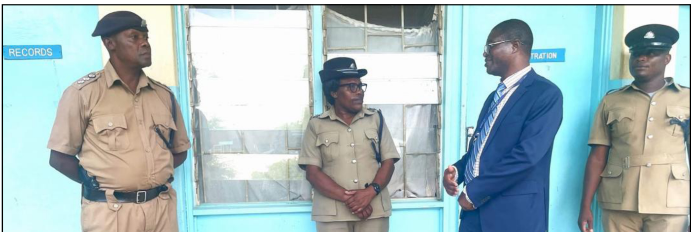
Salima Police Items Donation